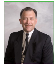
2009-2010 Executive Board: (top to bottom)